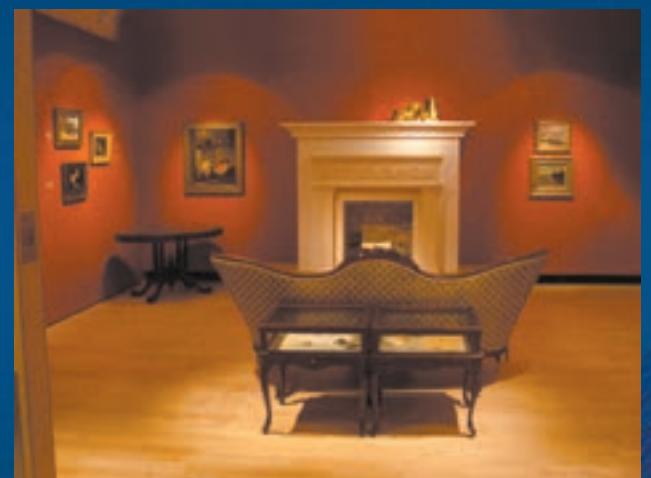
Woodstock Art Gallery