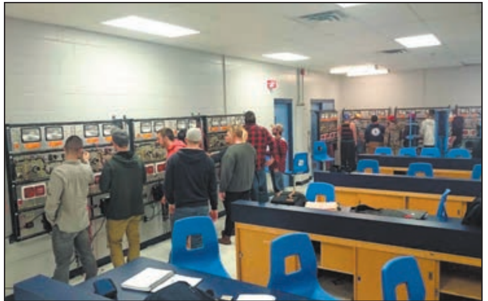
CONESTOGA COLLEGE/GUELPH CAMPUS